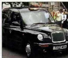
8 a taxi