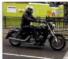
4 a motorbike