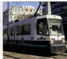
5 a tram