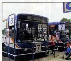
13 a bus station