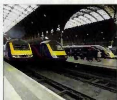
11 a station