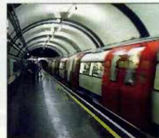
10 the underground