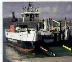
9 a ferry