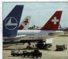
14 an airport