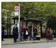
12 a bus stop