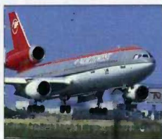
7 a plane