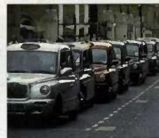
15 a taxi rank