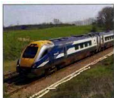
1 a train