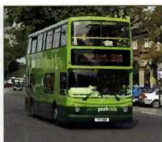
2 a bus