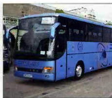
3 a coach