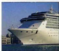
6 a boat